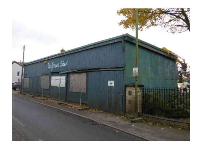
The Green Shed in Fore Street in 2017. (JFB)

and work with metal. When that generation retired, activity on the site fell. The warehouse subsequently re-invented itself as the Green Shed with various uses until its final demise in November 2017.