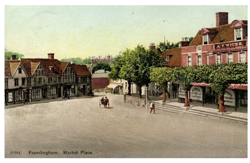
The Market Hill was clearly not a scene of great activity all the time.

The crinkle-crankle wall in 1987, prior to the site being cleared for the Coop development.